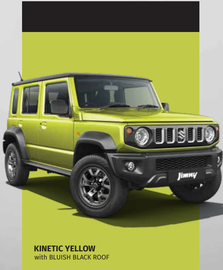
KINETIC YELLOW with BLUISH BLACK ROOF