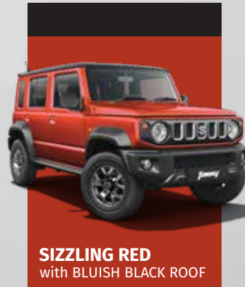
SIZZLING RED with BLUISH BLACK ROOF