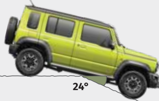
RAMP BREAKOVER ANGLE