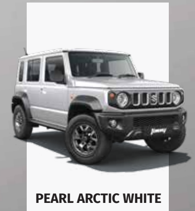
PEARL ARCTIC WHITE